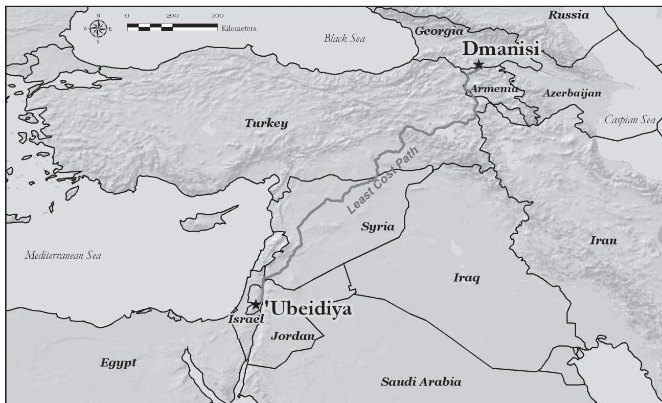
FIGURE 1: Regional map showing origin ('Ubeidiya, Israel) and destination (Dmanisi, Georgia) points for the Cost Path Analysis.

A theoretical dispersal path was constructed between the Levant and the earliest well-accepted evidence for hominid occupation outside of Africa—Dmanisi. Any origin point in the area provides the same results;