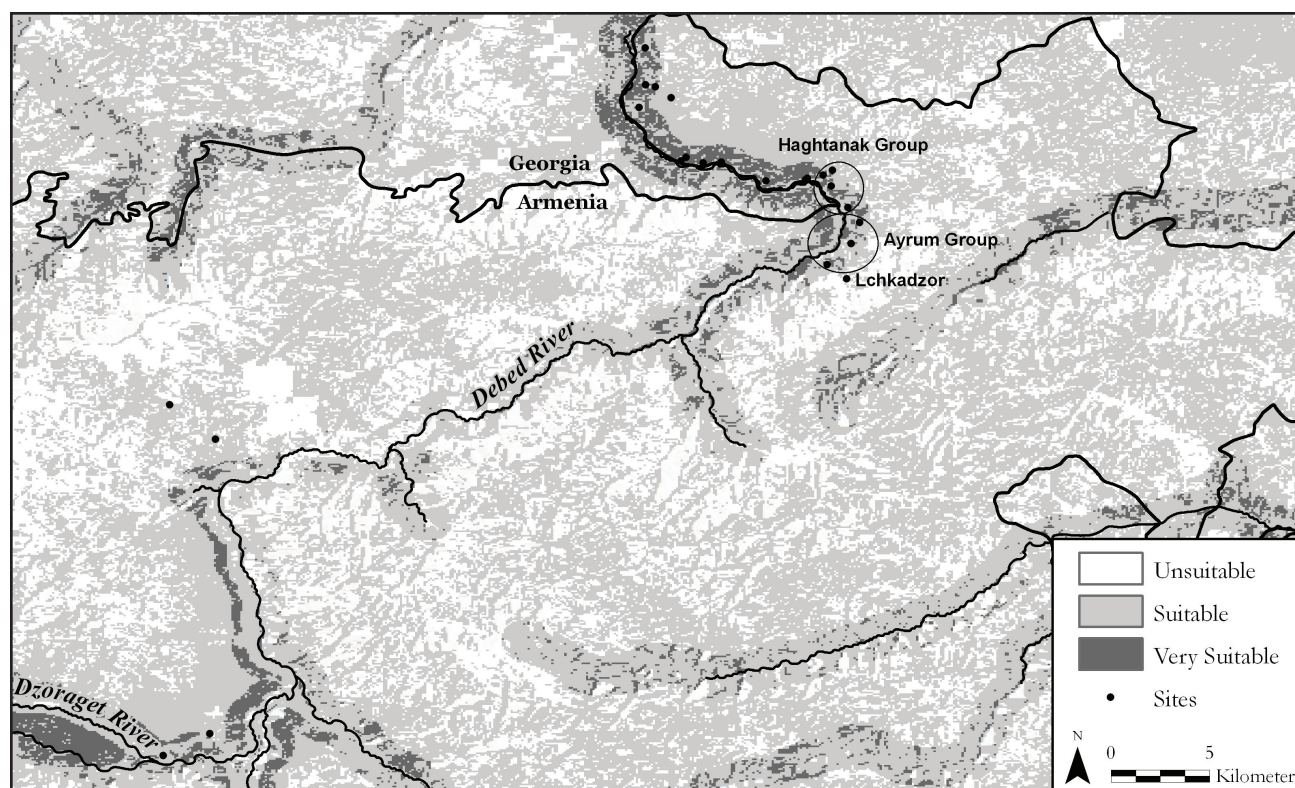
FIGURE 3: Raster map of site suitability scores for the Debed River Valley and the location of identified paleoanthropological sites.

particular category. For land cover, known Paleolithic sites were most often associated with mosaic croplands/vegetation (a total of 23 times). Because this represented the highest frequency of associations, croplands/vegetation received a suitability score of 1 and all subsequent scores were scaled to this value. The linear scale transformation values for each variable were summed using the raster calculator, averaged to remove potential outliers, and multiplied by 100. This resulted in a composite suitability score that ranged from 0 (lowest suitability) to 100 (highest suitability). In general, the highest suitability scores were associated with areas located near rivers with low slope and relatively open vegetation (i.e., cropland). Tables 2-4 summarize the LST scores for aspect, slope, and elevation. A 2 km buffer was constructed along major rivers to assign distance-to-water scores.